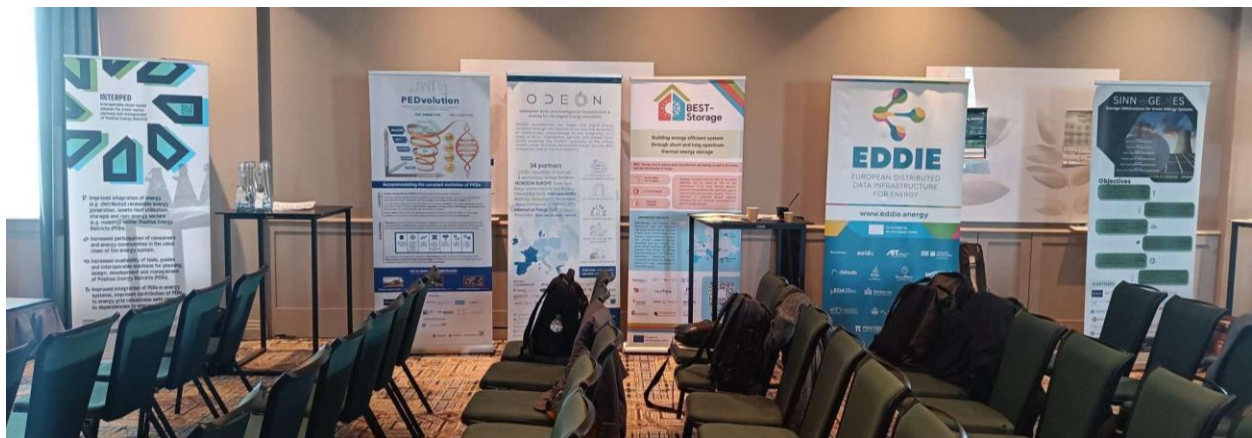
BRIDGE General Assembly

The BRIDGE General Assembly brought together energy innovators from across Europe at the DoubleTree by Hilton in Brussels. Supported by the European Commission, this two-day event highlighted key advancements in the energy sector. InterPED presented its work on Positive Energy Districts (PEDs) through cloud-based platforms and cross-vector optimization during the ‘Networking Coffee & New BRIDGE Projects Showcasing’ segment. Engaging in sessions on consumer engagement and regulatory frameworks, InterPED contributed insights on integrating communities into energy management. The event concluded with future-oriented goals, reinforcing InterPED’s role in supporting Europe’s sustainable energy transition.