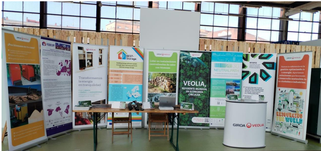
Basque Sustainability Fair